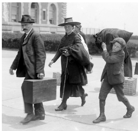
IMMIGRANT ARRIVALS AT ELLIS ISLAND

What is American music? The great conductor, composer, and communicator Leonard Bernstein posed this very question in a Young People's Concert broadcast on CBS in 1958: "What makes certain music seem to belong to America, seem to belong to us?" The answer lies in our rich heritage as a nation of immigrants. "There are as many sides to American music as there are to the American people—our great, varied, many-sided democracy," Bernstein explained. By the 1920s, these multiple influences started to coalesce into something of a national sound: "So what our composers are finally nourished on is a folk music that is probably the richest in the world, and all of it is American in spirit, whether its jazz, or square-dance tunes, or cowboy songs, or hillbilly music, or rock and roll, or Cuban mambas, or Mexican huapangos, or Missouri hymn-singing. It's like all those different accents we have in our speaking... But they're all American accents."